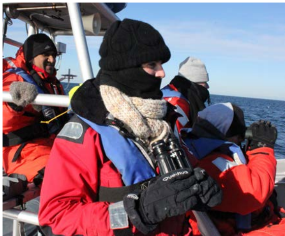
Participants bundled up for the annual Christmas Bird Count in the sanctuary. Temperatures hovered in the teens throughout the day.