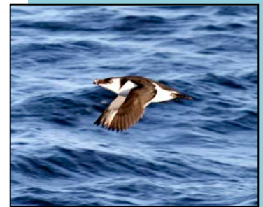
Razorbill in flight.

Atlantic Puffin Black Guillemot Black-legged Kittiwake Black Scoter Bonaparte's Gull Canada Goose Common Eider Common Loon Common Murre Dovekie Great Black-backed Gull Herring Gull Iceland Gull Northern Gannet Razorbill Ring-billed Gull