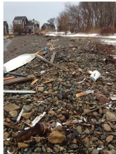
Storm debris litters the boathouse beach berm after the storm.

Strong winds, heavy snow and crashing waves battered the Scituate coastline during Feb. 8-9. From New York to Maine, the historic storm, nicknamed Nemo, caused power outages and wreaked havoc. The shoreline of Scituate, which sticks out into Massachusetts Bay and traditionally gets pounded by waves forced across the Gulf of Maine by northeasters, was hit hard again. Local newscasters gravitate to this location for the most dramatic footage of wave action, street flooding and coastal erosion. Massachusetts Governor Duval Patrick closed state highways to all but emergency vehicles from Friday afternoon through late Saturday. Sustained winds at the height of the storm were close to 50 mph and gusts reached hurricane force.