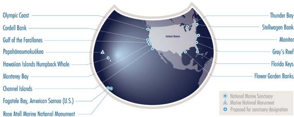
Scale varies in this perspective. Adapted from National Geographic Maps.

National Oceanic and Atmospheric Administration National Ocean Service Office of National Marine Sanctuaries Gerry E. Studds Stellwagen Bank National Marine Sanctuary